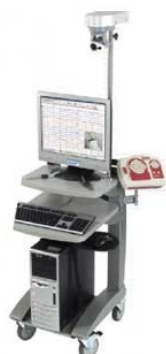
Video EEG Equipment

Statistics on the prevalence of these misdiagnoses are not available. Although it is believed that as many as 5% of people diagnosed as having epilepsy have Non-Epileptic Attack Disorder and up to 7% could have both.